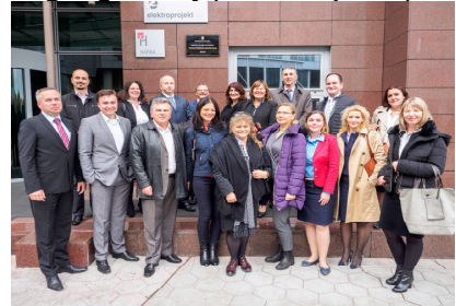
Study tour participants and ARPA staff