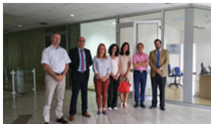
RTA, assistants and MS experts

This Twinning project is being implemented with the assistance of the Central Audit Service, Dutch Ministry of Finance in cooperation with the Croatian Agency for Audit of European Union Programmes Implementation System.