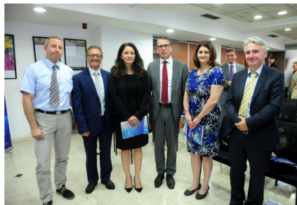
Twinning management team

Completed and mandatory result achieved 100%